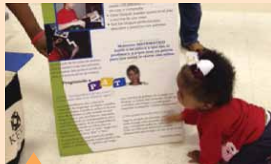
Looks like the literacy stations are working well for this youngster!