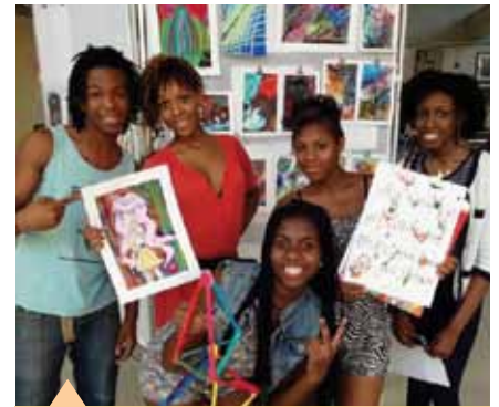
Students are proud to share their artwork at the Art Studio Lab's final exhibition and reception.