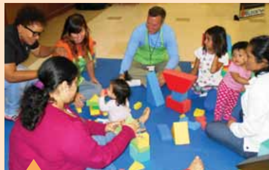
The BLOCKFest exhibit helped parents learn fun ways to incorporate math and science concepts and vocabulary during developmentally-appropriate play.

The event was made possible by the support of over 30 volunteers from Elevation Church, the Charlotte Mecklenburg Library, and registered nurses specializing in pediatrics and labor and delivery.